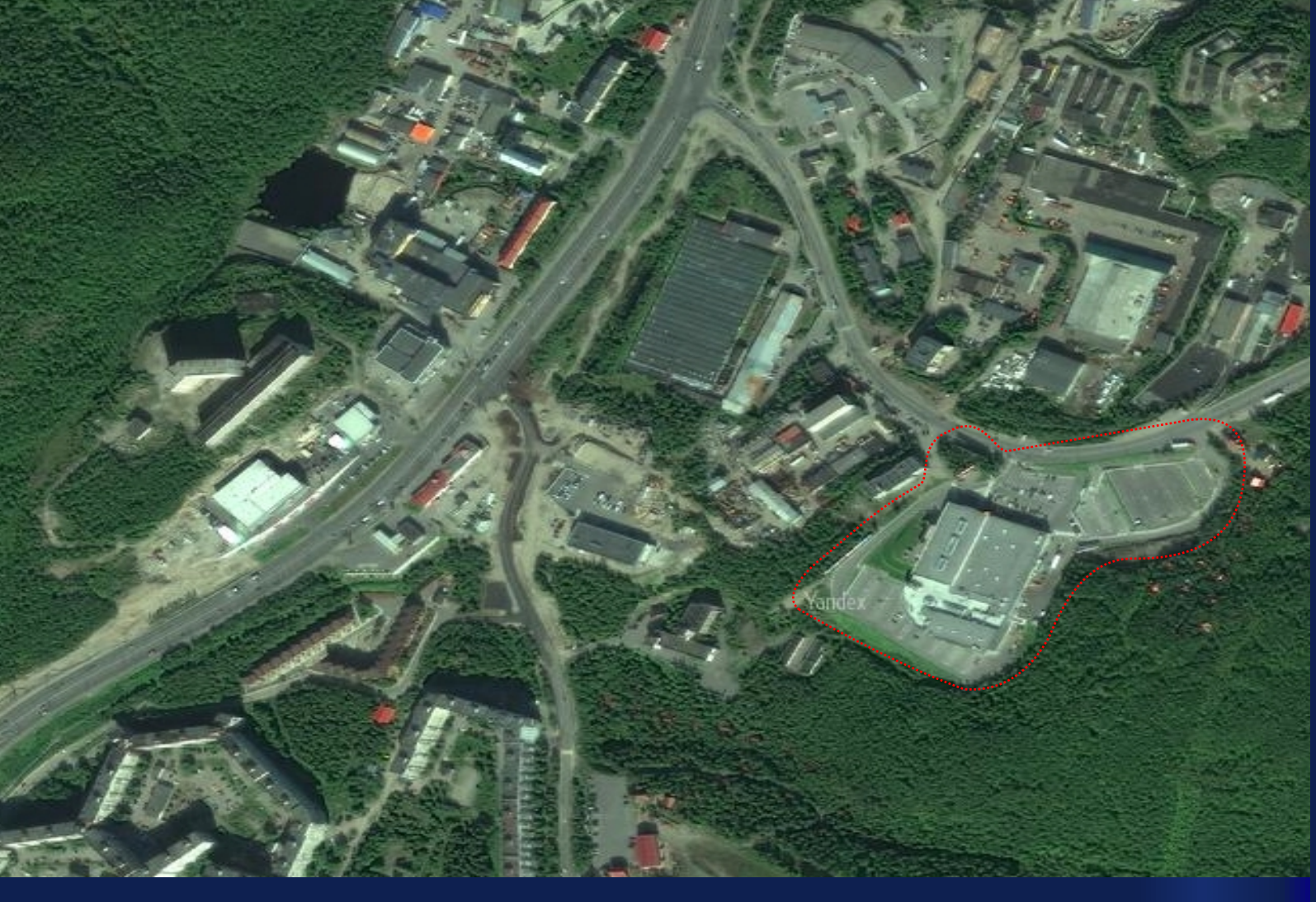
EASY ENTRY / EXIT, OPEN GROUND PARKING, CONVENIENT HANDLING ZONE